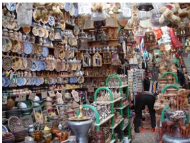
Tunis the capital of Tunis