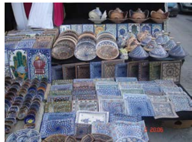
Sidi Bo Isead, Tunis