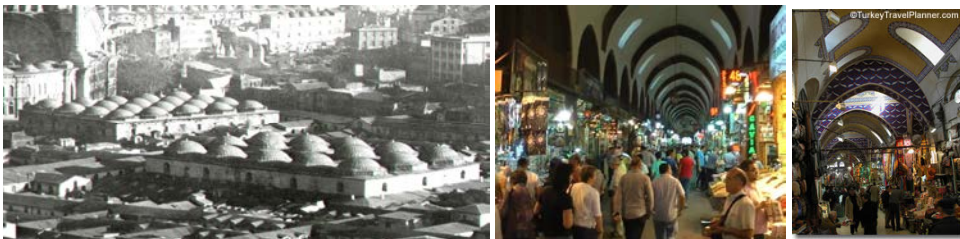
Figure 3: Ottoman Bazar in Istanbul.

Eleanor Sims believes that the root of the adopted styles of the designs in these commercial buildings and oases is the architecture that Muslims knew during their travels and conquests along with their talent and needs. The simple design which characterized the market remained throughout the centuries despite different places and building materials without losing the identity or the character of the market. The Arabic suq is a market located on four streets; each in a different direction. So, it is the central market generated by the cross roads. The first Islamic market was called Chahar-Suq, for the major intersections within the covered network of market streets.