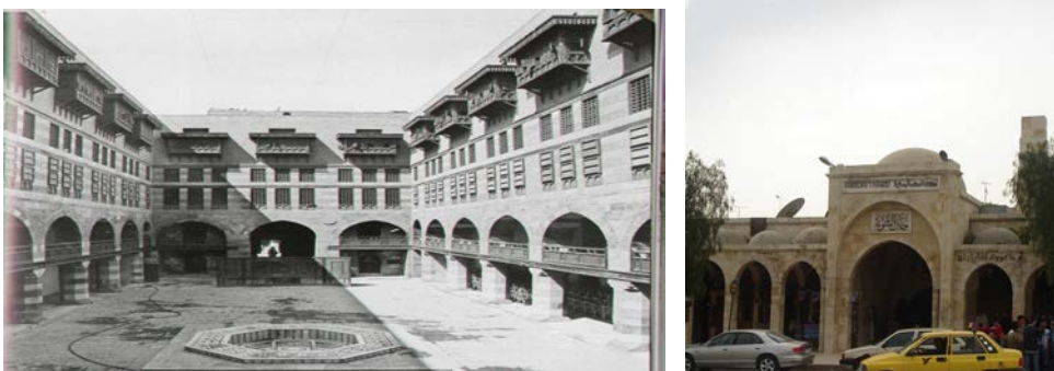
Figure 1: The Khan, one of the commercial buildings.

Commercial buildings were also built on the roads to lead to the holy places in the Islamic world. Religion, climate and social life were the factors behind establishing various buildings as markets and the architectural morphological form of the building.