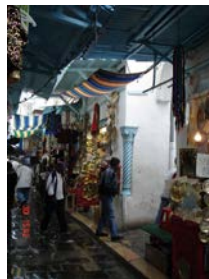
Bab Ighar, Tunis